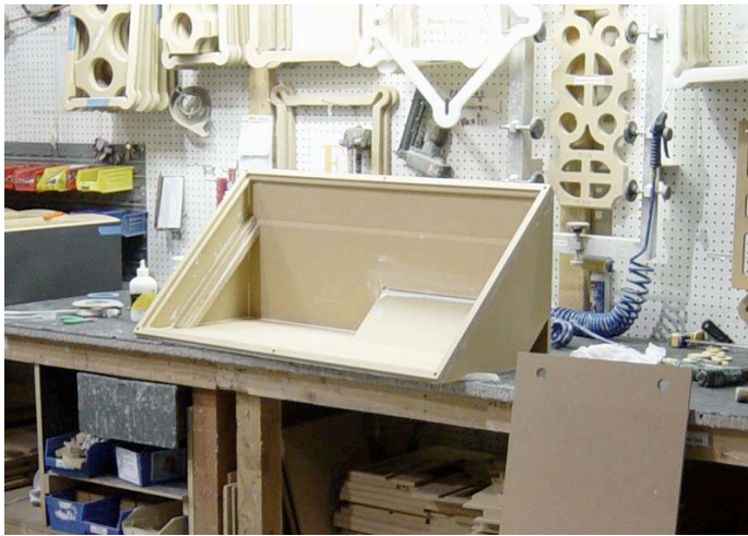
Fig 4: Enclosure awaiting assembly