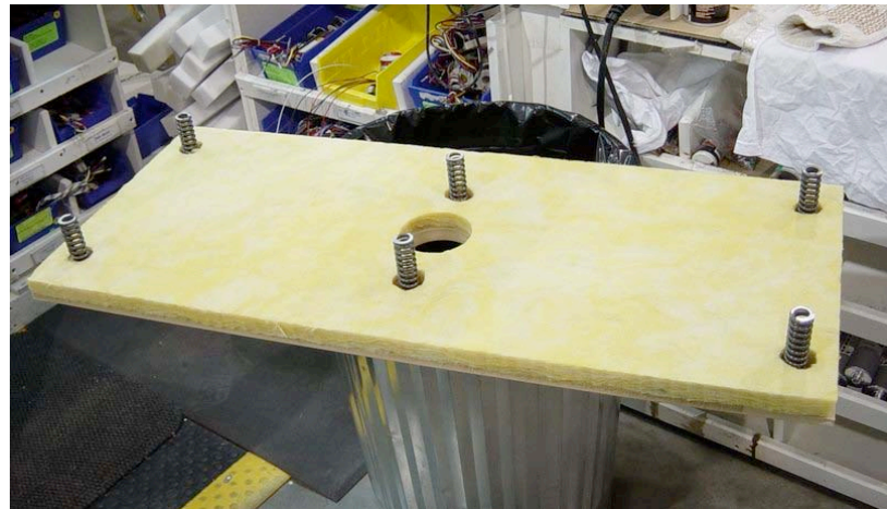
Fig 7: Intermediate plate with springs and stuffing