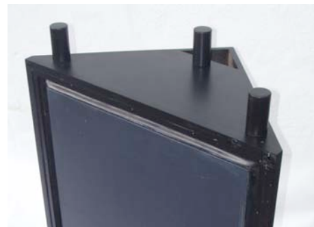
Fig 3: SpringTrap bottom revealing the primary port

Fig 2: SpringTrap cutaway view Notice the intermediate ported baffle and precision springs