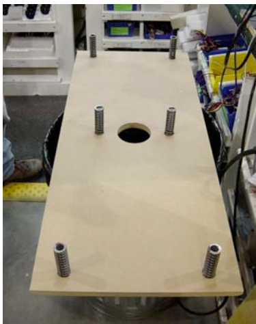
Fig 6: Intermediate plate with springs