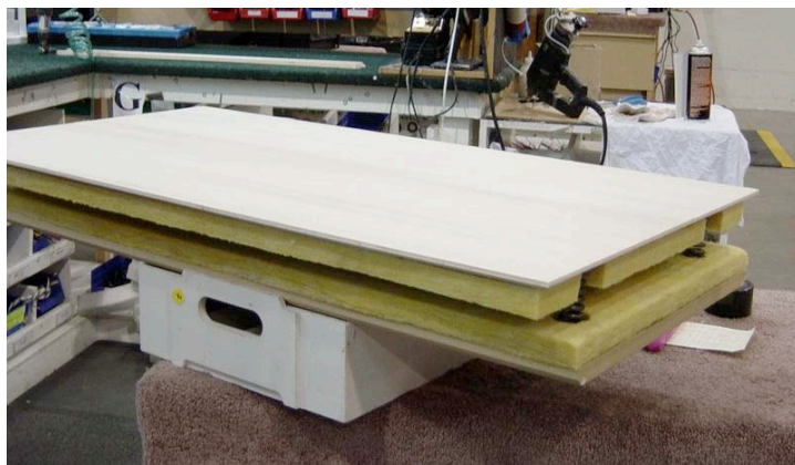
Fig 8: Completed diaphragm assembly